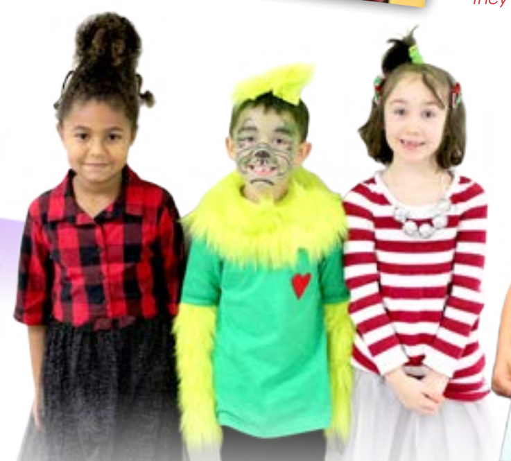
First graders participated in Grinch Day. Here, the Grinch is seen with some members of Whoville.