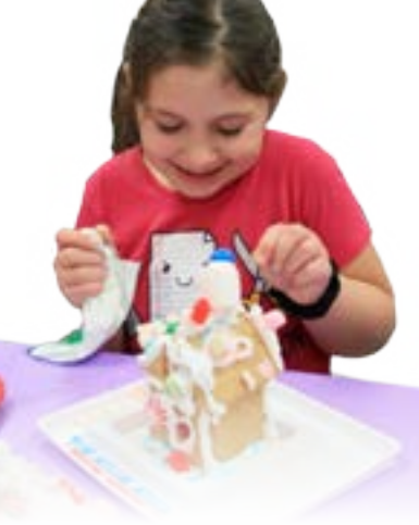
Second graders made gingerbread houses in the Elementary Café on Dec. 19, with help from family members and members of the National Junior Honor Society and Middle School Student Council. Houses were constructed in the morning, left to dry, and then decorated in the afternoon.