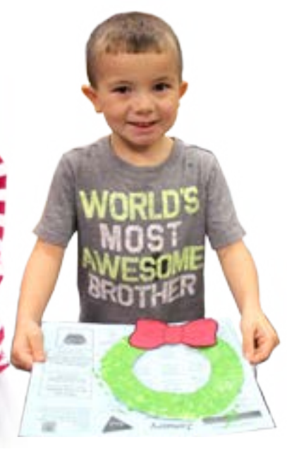
Kindergarten students participated in making holiday crafts.